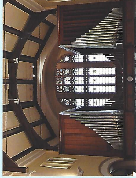
The organ at Trinity Episcopal Church

Our mission is to enrich the local, regional, and international community through exceptional chamber music performances that engage and inspire diverse audiences.